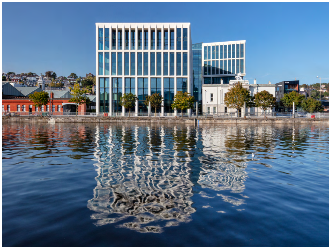
Penrose Dock - External View