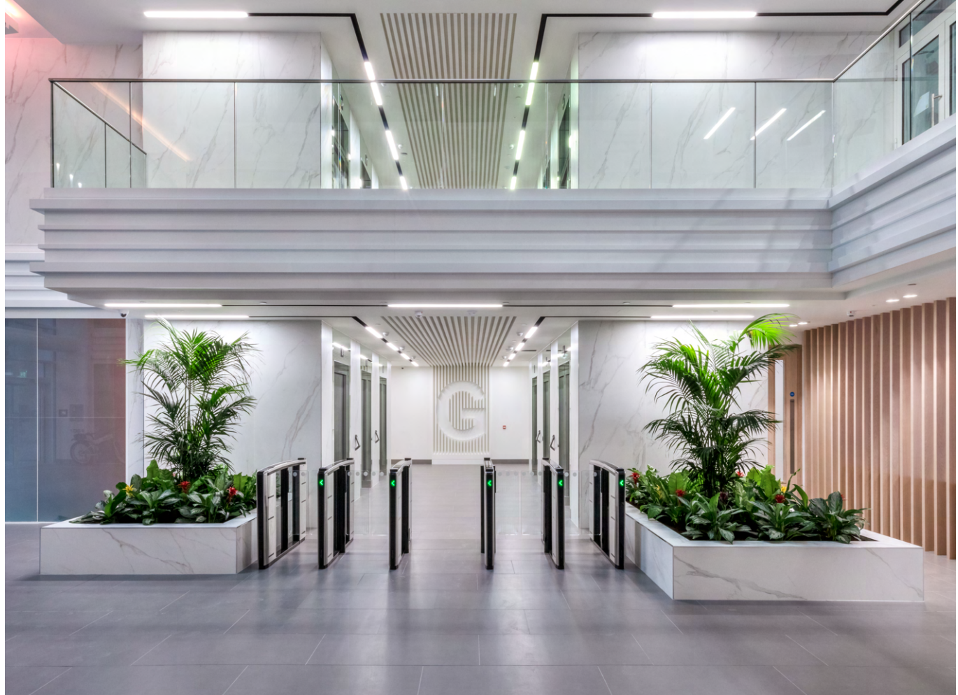
Ground Floor Lift Lobby Entry