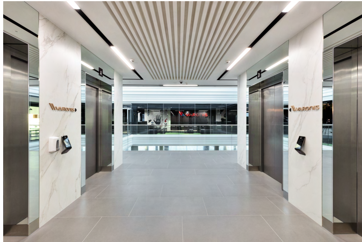
Typical Lift Lobby